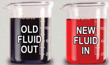
The ProMax40 fluid X-changer replaces virtually 100% of the transmission fluid.